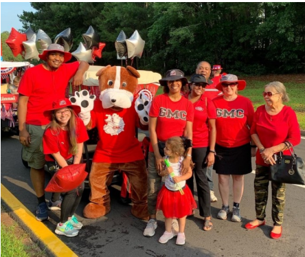
Staff, faculty and friends enjoy Independence Day at the Peachtree City Parade on July 3.